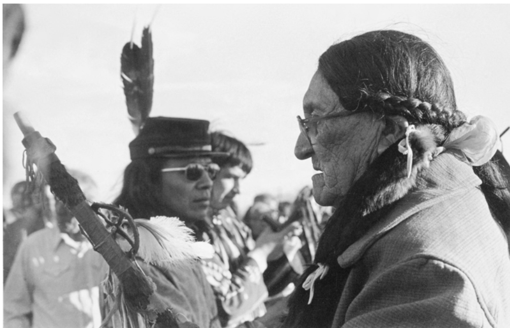
Chief Frank Fools Crow prays with the pipe.

Elders and chiefs met for the rest of the day. Finally, they proclaimed they would negotiate with the U.S. government only as equals, as the Independent Oglala Nation, a revival of the Great Sioux Nation established by the Fort Laramie Treaty of 1868, which granted the Black Hills to them in perpetuity. Knowing full well that government reprisals would be swift and violent, they nonetheless made their stand.