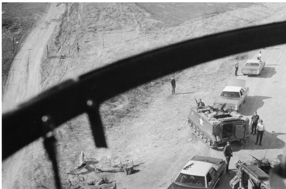
An FBI roadblock.