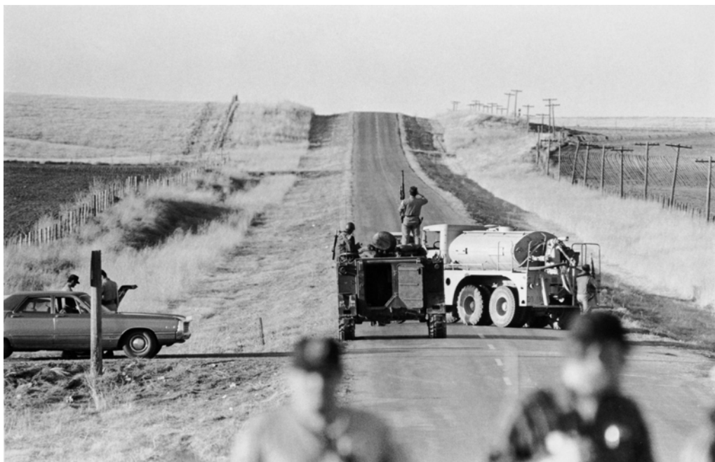
U.S. Marshals and FBI agents armed with M-16 automatic weapons, sniper rifles, and armored personnel carriers block the road between Pine Ridge and Wounded Knee.

ally detained; they warned us not to press our concerns too strongly because we would be arrested without cause.