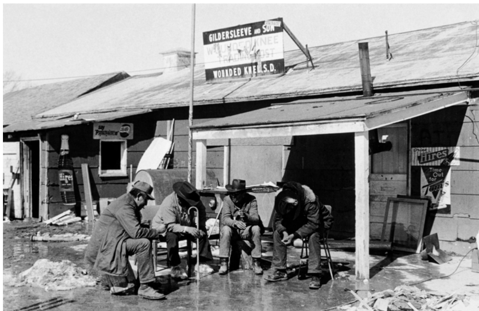
Elders gathering outside the trading post early in the liberation.

It was nearly sundown when we finally arrived in the occupied area. We were taken directly to the hospital, such as it was, located in a small cement-chinked log cabin, the only building with both running water and electricity. Fortifications across the road, around the church, were already substantial. During the next few weeks more positions would be created, and the existing emplacements further fortified. No one had planned this protest to last more than a day or two, and no one ever predicted the aggressive response of the FBI and U.S. Marshals. But the AIM activists and the Lakota people they represented were not giving in without a fight.