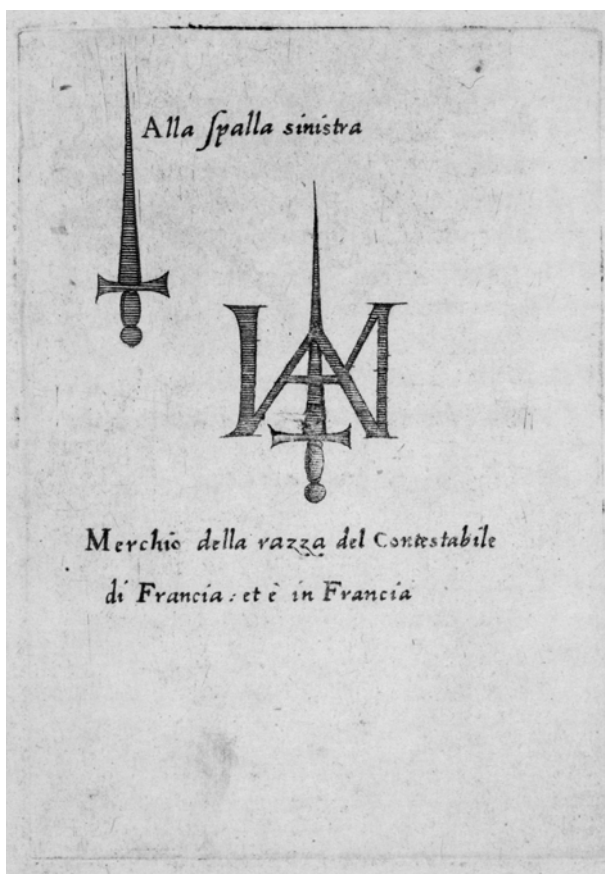
First plate of brands in Libro de marchi de caualli con li nomi de tutti li principi et priuati signori che hanno razza di caualli (Venice: Nicolo Nelli, 1569). Princeton Collections of Western Americana, Department of Rare Books and Special Collections, Princeton University Library. Gift of the Friends of the Princeton University Library.

Before the nineteenth century, the printed brand book seems to have remained confined to Italy and horses. Princeton has four other examples, all published in Venice between 1588 and 1770. 3 All follow the same format of a handy duodecimo size and a series of pages with a single plate per page identifying the primary brand and any